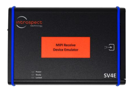
Image sensor and camera module tester. Includes rapid image capture and video streaming capability